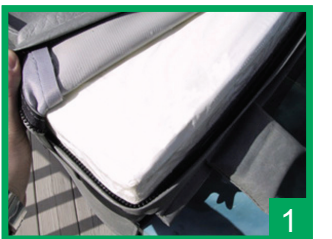
Heat sealed vapor wrap.