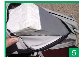
A super-strong 3" galvanized steel C-channel adds superior strength to the cover's center.