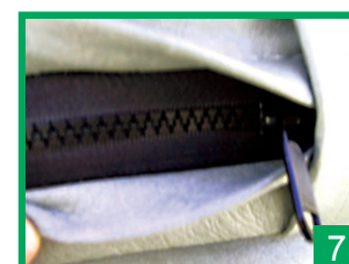
Heavy duty nylon zipper.