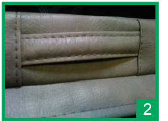
Integrated, reinforced handles.