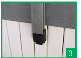
Hold-down straps with locking buckles.