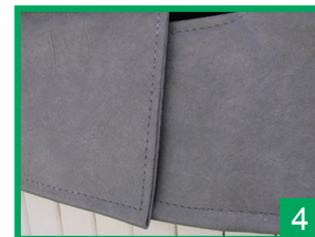
Double skirt retains heat and protects acrylic spa lip from fading.