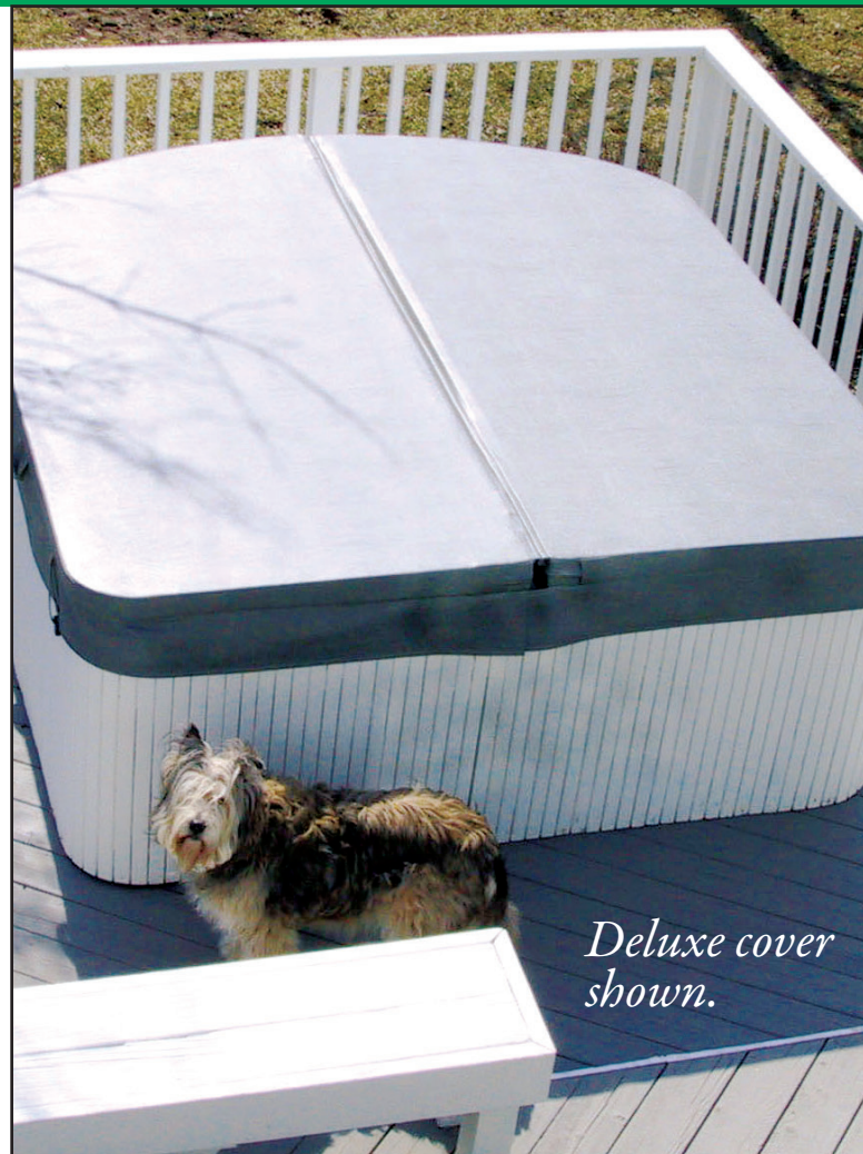
Deluxe cover shown.

Our professional spa covers offer secure protection for your family while providing high energy-efficiency and lasting protection against the elements and UV rays. Every detail and component of our spa covers is expertly designed and crafted to meet or exceed industry specifications. Whether your spa is standard or an in-ground masterpiece, we have you covered!