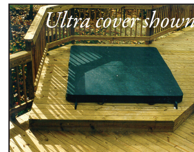
Ultra cover shown.