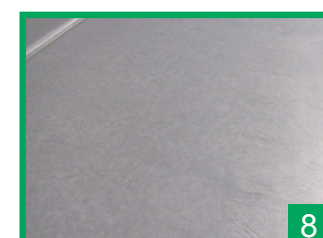
Highest quality marine grade vinyl with UV and weather resistant finish.