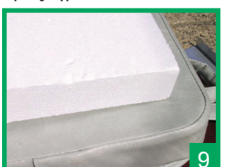
Strong tapered highly insulating EPS foam core.