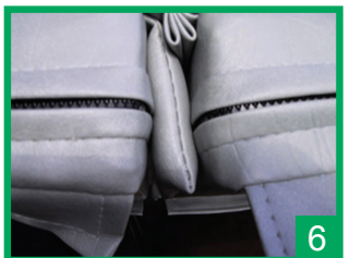
2 large heat seals lock in heat and lower operating costs. *OPTIONAL Full-Width Heat Seal Available. *Upcharge Applies