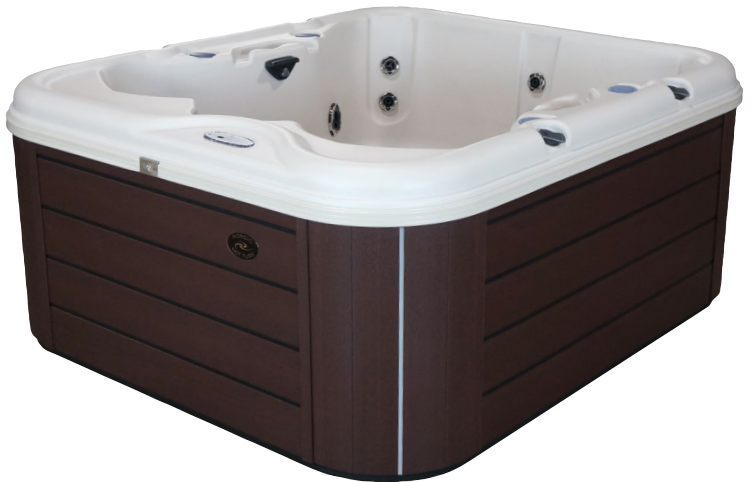
Shell: French Vanilla | Cabinet: Mahogany